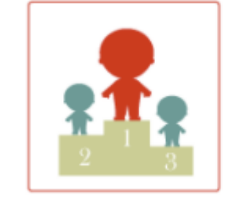
We help children that other mentoring programs don't