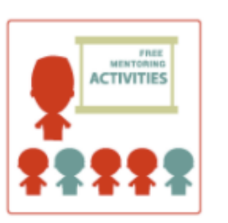
We run dedicated activities at free or lowcost